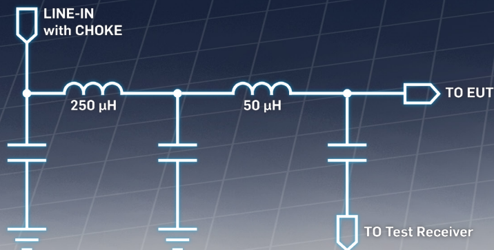
L3-100 equivalent circuit

(AC-BNC adapter for LISN verification and calibration)